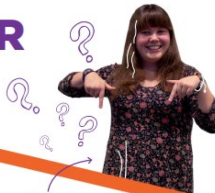
Rosie Digital Apprentice, EY